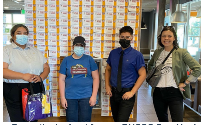
Be on the lookout for our RHCSC Pop-Ups!

Send us your pictures of how you are promoting Hearts for the House or incentivizing your crew and customers! We would love to showcase you in our next newsletter. #HeartsfortheHouse